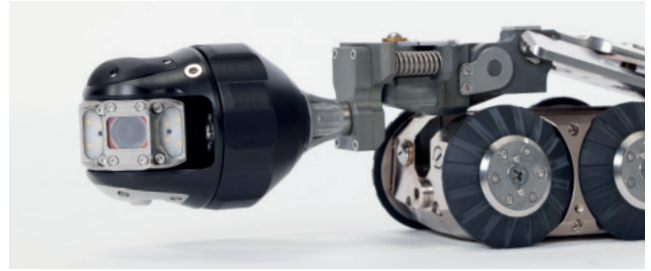
KS 60 DB camera From 4" inches