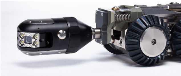
KS 40 camera From 3" inches