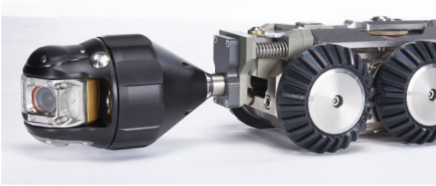
KS 60 HD camera From 4" inches