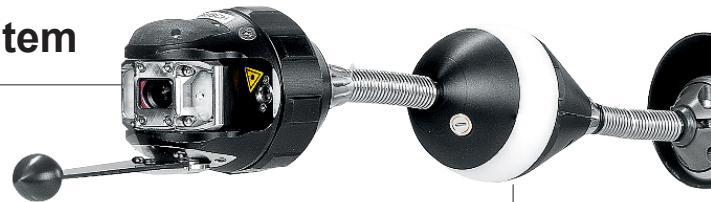
LATRAS sensor head

The Omicron can be supplemented with the LATRAS sensor head. The documentation is performed using the Rausch-Tab.