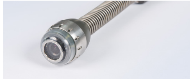
SAT 42 camera From 2" inches